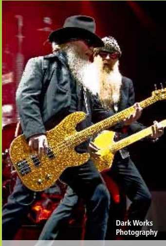
Dark Works Photography