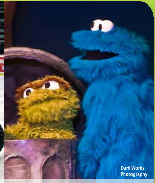
Dark Works Photography